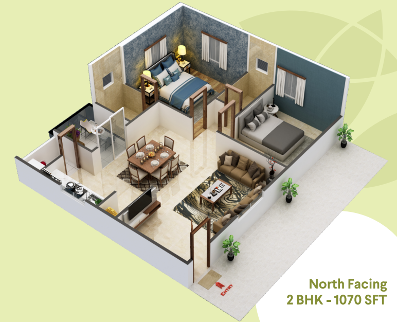
North Facing 2 BHK - 1070 SFT