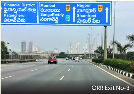
ORR Exit No-3