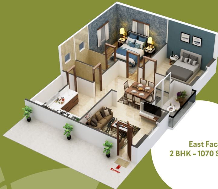
East Facing 2 BHK - 1070 SFT