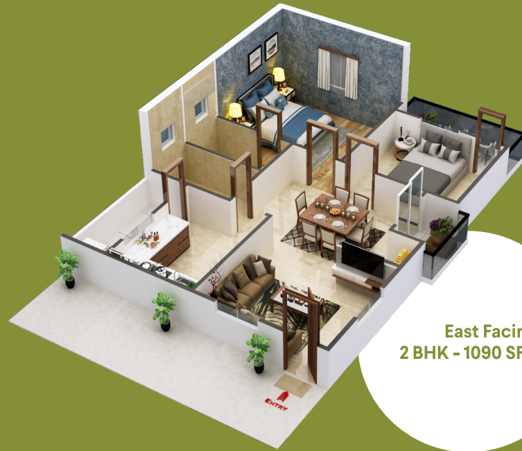
East Facing 2 BHK - 1090 SFT