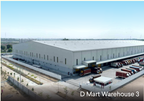
D Mart Warehouse 3