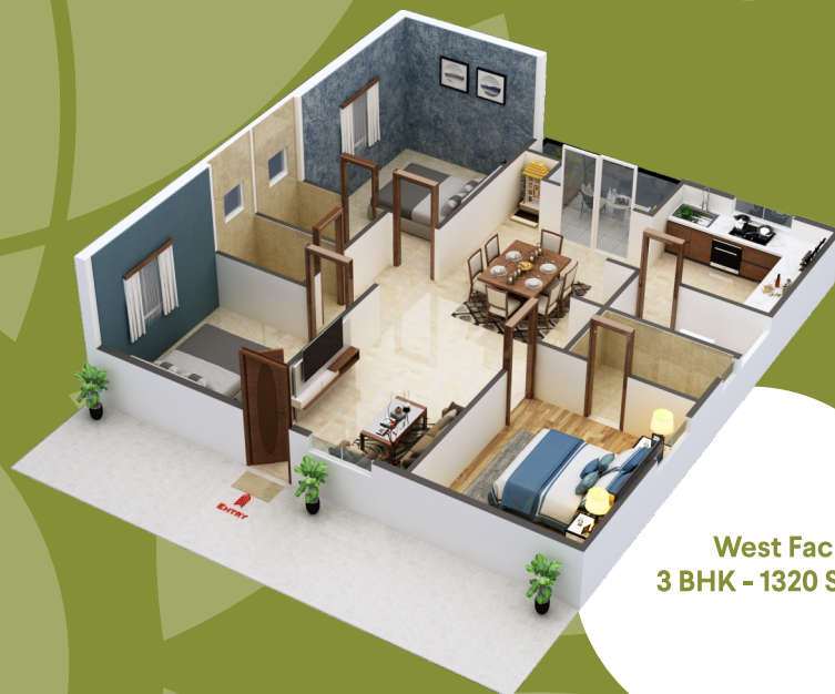
West Facing 3 BHK - 1320 SFT