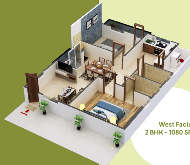
West Facing 2 BHK - 1080 SFT