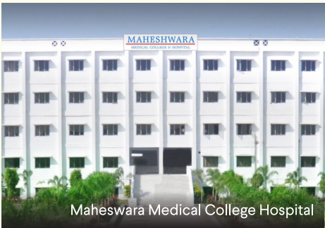
Maheswara Medical College Hospital