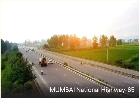
MUMBAI National Highway-65