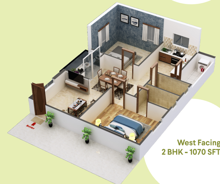
West Facing 2 BHK - 1070 SFT