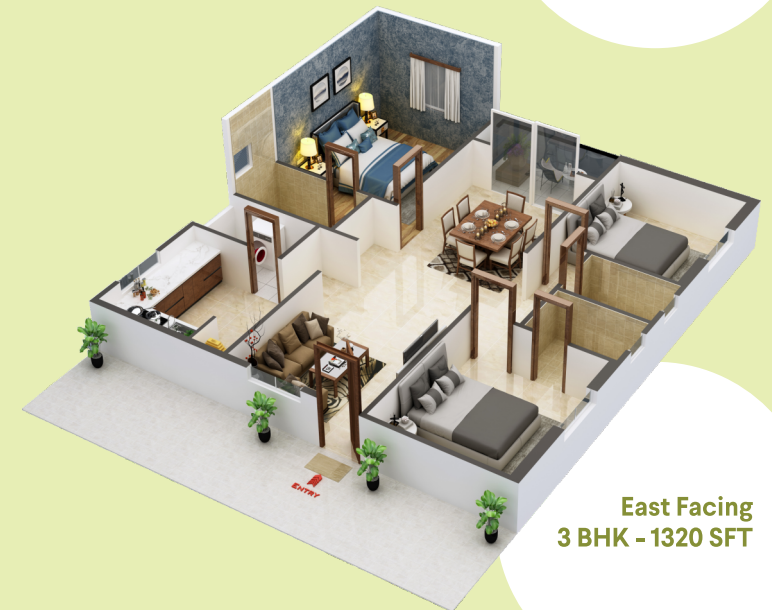
East Facing 3 BHK - 1320 SFT